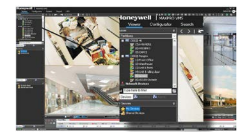
Honeywell's MAXPRO VMS (video management system) controls multiple sources of video subsystems to collect, manage and present video in a clear and concise user interface.