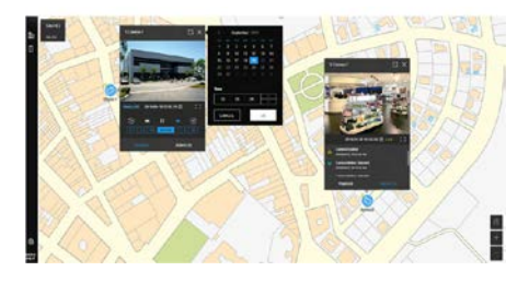
With MAXPRO VMS R600 release, a brand new Security Console web client is introduced, offering intuitive map navigation across sites, buildings and floors, and camera live view pop-up, instant playback and alarm indication on maps,