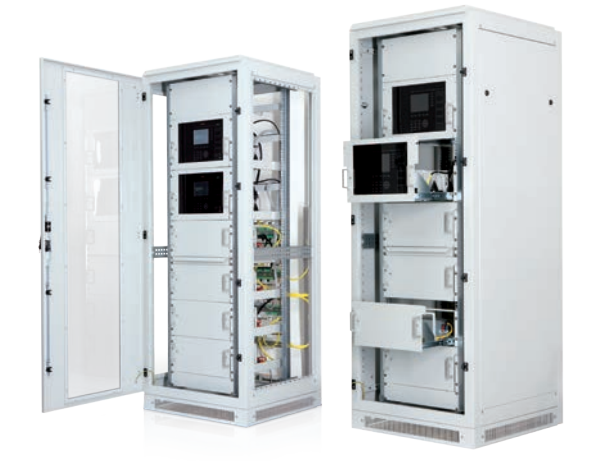
FlexES Control as 19" rack version provides the highest flexibility for industrial applications through professional cable routing, offering various options for cabling.

The speaker loops can be configured independently and divided into three sections at Zentrum am Berg. If it is necessary for operation, the system can be expanded as required to add electro-acoustic emergency warning systems to other areas of the facility. All power amplifiers are permanently monitored and can be replaced dynamically. All loudspeaker lines are permanently monitored for short circuit, ground fault, and failure as well as impedance deviation. Faulty loudspeaker zones are separated in a non-reacting manner.